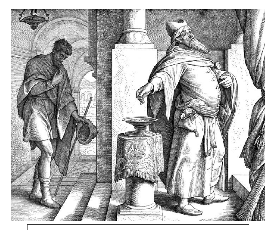
The Eleventh Sunday after Trinity Sunday August 11<sup>th</sup>, 2024

Grant, I beseech Thee, Almighty God, that the Word which I have heard this day may through Thy grace be so engrafted in my heart that I may bring forth the fruit of the Spirit; through Jesus Christ, my Lord. Amen.