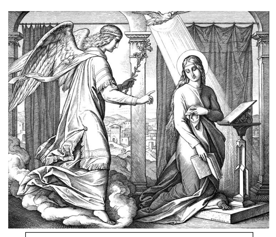
The Festival of the Annunciation of our Lord March 25<sup>th</sup>, 2025

Scripture quotations are from the Revised Version of the Holy Bible (1895) with Apocrypha. This work is in the Public Domain.