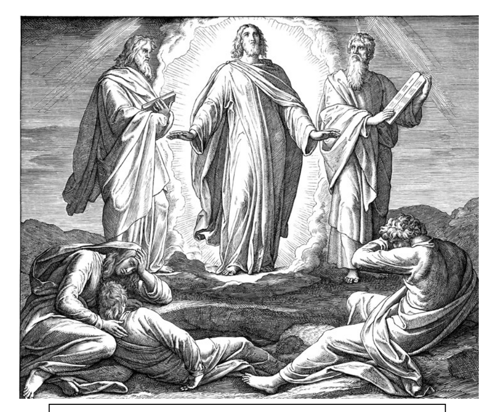
The Festival of the Transfiguration of our Lord February 6<sup>th</sup>, 2022

Grant, I beseech Thee, Almighty God, that the Word which I have heard this day may through Thy grace be so engrafted in my heart that I may bring forth the fruit of the Spirit; through Jesus Christ, my Lord. Amen.